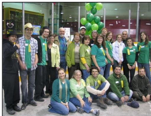
2009 Green Tradeshow Volunteers

Terrace Bay has been informally working towards becoming an innovator in utilizing renewable energy and energy efficient practices throughout its history. The Municipality was created by the forestry industry and with it the construction of the 51mW Aguasabon Hydro Generating Station to fuel the growth of the Township. At one time, a large portion of the Municipality was heated utilizing a centralized district heating system for a large boiler unit near the Highway that supplied waste heat to the Recreation Centre, schools, and downtown core. The Municipality undertook an energy audit in 1997 and implemented numerous measures to become more energy efficient in its building and operations. Terrace Bay has held training for its residents on energy efficiency through the EcoEnergy Retrofit program and has been a pioneer in Green Education through the conduct of the popular Green Tradeshow displaying different environmentally friendly products, services, and idea to the public.