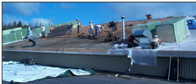
2008 Recreation Centre Replacement Roof Project