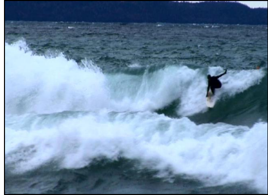
Surfing on Lake Superior in Terrace Bay