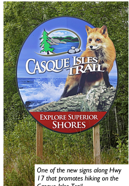
One of the new signs along Hwy 17 that promotes hiking on the Casque Isles Trail.

admired the view, and this time I was able to identify most of the islands (I swear I could see the Battle Island lighthouse tower through my binoculars, though perhaps I was just imagining it). I found the Worthington Bay photographs again, looking only just slightly more faded than they had the last time I was there. I marvelled at the spring flow over Aguasabon Falls and the beautiful cascades down Rainbow Falls. I played with the cobbles on Schreiber Beach – and said a few words of thanks for that brilliant new road that allowed me to drive down the hill from town. I scrambled rather more gingerly than I used to over the talus and raised beaches near Lyda Bay (my dog Skye is 10 now, and