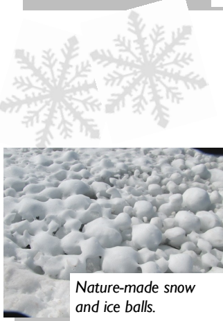
Nature-made snow and ice balls.