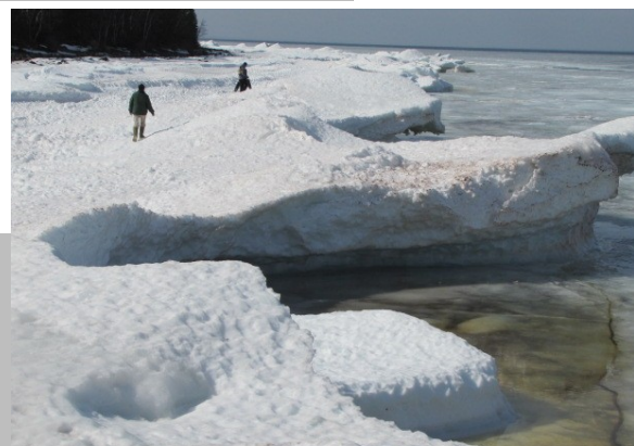
An Arctic ice floe?