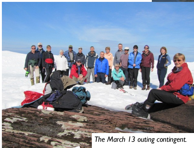
The March 13 outing contingent.