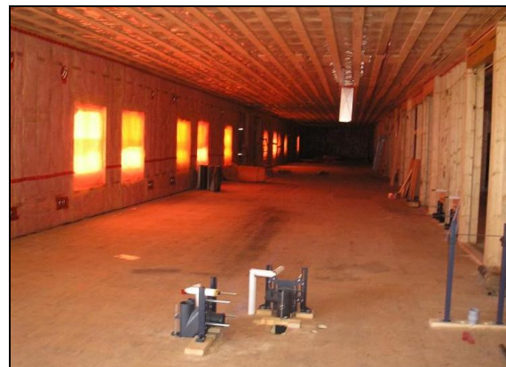
March 2010 Construction