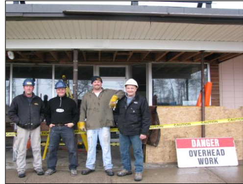
Canopy work by DRD Construction

The $3 million Downtown Revitalization Project is in the final engineering stage and will have drawings to display to the public soon. Project construction officially began with the removal of soffit and asbestos board underneath the canopy in November 2009 (see picture on right). The soffit and asbestos board removal will allow the architects from Kuch Stephenson Gibson Malo to evaluate the structural integrity of the canopy and further engineer improvements. The canopy soffit will not be replaced until Spring/Summer 2010 as the project needs to be engineered, tendered, and a construction company chosen before the purchase and installation of materials.