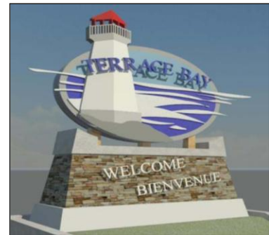
Mockup of Entrance Sign

Please visit the project's webpage at www.terracebay.ca/drp for project updates.