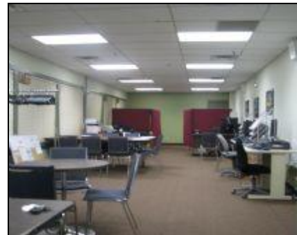
Labour Action Centre Office

The Terrace Bay Schreiber Action Centre was established for those affected by the shutdown of Terrace Bay Pulp Inc. and held its official grand opening on October 8, 2009. The Action Centre is the result of a collaborative effort by the Township of Terrace Bay, Township of Schreiber, and the United Steelworkers Local 665 and is funded by the Ministry of Training, Colleges and Universities. The Action Centre is located in the Terrace Bay Community Centre and provides area residents with job placement and training assistance.