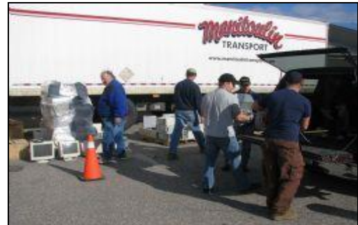
Taking in Electronic Materials

The Township of Terrace Bay hosted a special waste recycling day for residents to divert hazardous and electronic waste from the Terrace Bay Landfill. Hundreds of cars drove into the collection depot and materials collected filled two large trucks and part of a transport. The most common materials included paint and stain cans, batteries, propane tanks, computer monitors, and televisions. The materials were sent to Thunder Bay where they were either recycled or transported to recycling facilities in Southern Ontario. This initiative was part of Council's Strategic plan for 2007-2011 and the goal is to carry it out on an annual basis.