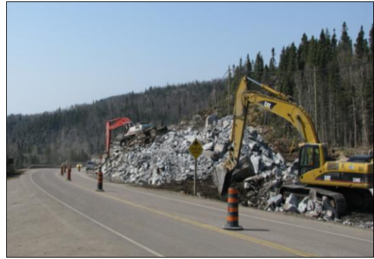
Early Construction on the Northeast Side

The construction of a new multi-million dollar bridge along Highway 17 over the Steel River has been ongoing since February 2010. The bridge is expected to be complete for travel in October 2010 and the old bridge will be torn down in the Summer of 2011. The Carillion company will be completing the required work and has a temporary office in Terrace Bay for administration purposes. The project has already hired some local workers and is expected to hire more throughout its duration.