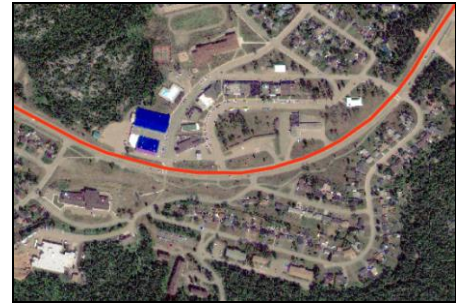
Satellite Image of the Downtown

Terrace Bay completed a project to acquire satellite imagery of the Municipality for marketing for investment attraction and tourism. The high quality images allow Township staff to create customized maps of different sections of the Municipality to respond to investor inquiries. The maps are featured at www.terracebay.ca/maps . The long-term goal is for the maps to be integrated into Google Earth and investment portals like the Ontario Investment Service.