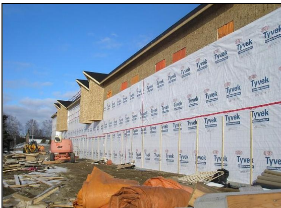
February 2010 Construction

The project has now embarked on a new fund raising campaign to furnish the facility. The goal of the “Furnish a Room Campaign” is to raise $215,213 to furnish the inside of the facility. Donations can be made individually, as a group or as part of the designated “Community Room”. For more information, you can visit the hospital’s web site at mccauslandhospital.com or by calling (807) 825-3273 ext. 134