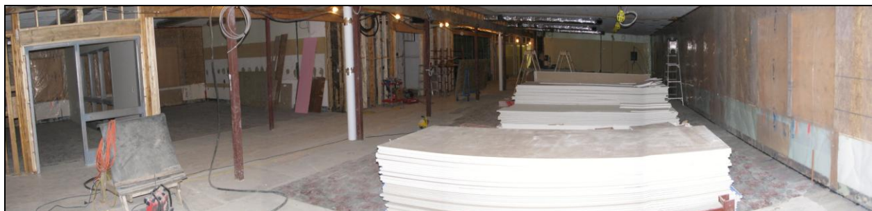
March 2010 – Renovation of the North Wing of the Cultural Centre

The Township of Terrace Bay officially began the construction phase of the Cultural Centre project on January 4, 2010. The project involves renovating sections of the vacant former St. Martin School building to provide for the relocation of the Terrace Bay Public Library and creation of the Michael King Hall (a full-service community auditorium with a new kitchen). The $1.9 million project is complementary to the activities of the Superior Seniors Club in renovating the South wing of the building into the Seniors Activity Centre. Construction should be completed in Summer 2010. For more information visit www.terracebay.ca/cc .