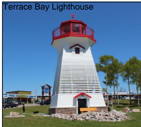
Terrace Bay Lighthouse