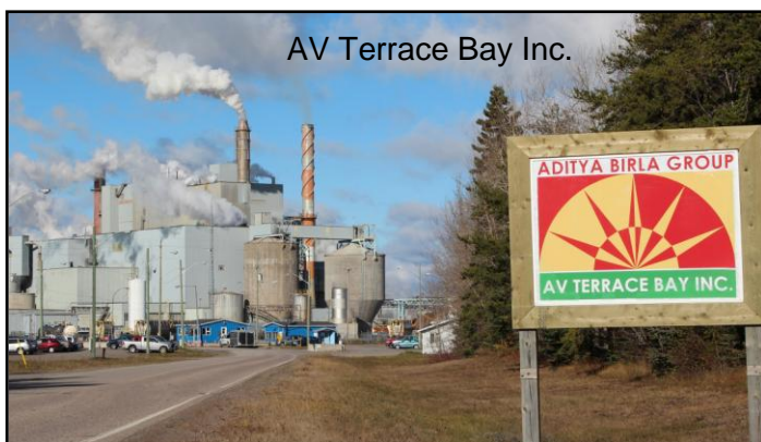
AV Terrace Bay Inc.