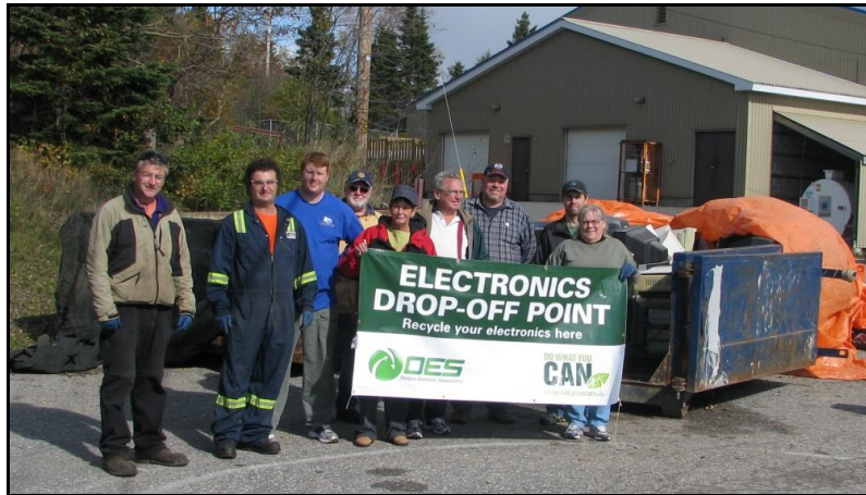
Hazardous Waste Recycling Day