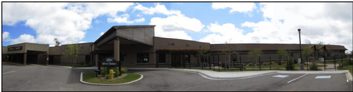
Wilkes Terrace Long-Term Care Facility