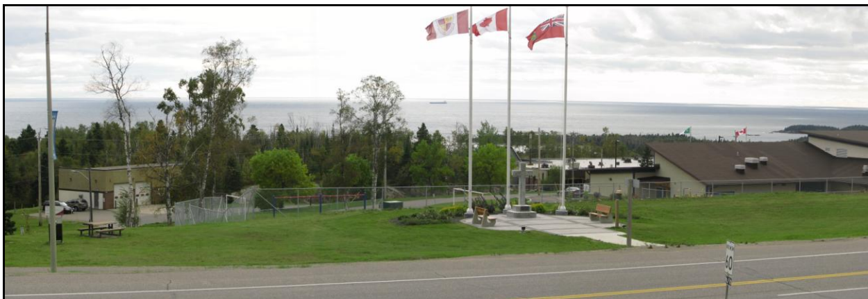
Terrace Bay Cenotaph Area