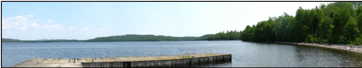
Dock on the Hays Lake Property