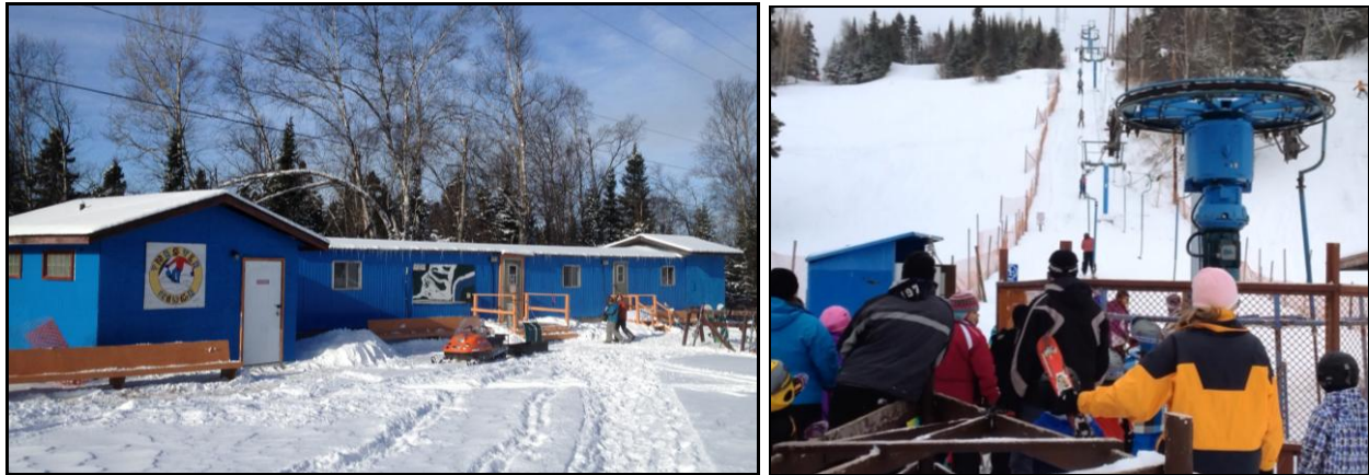
Trestle Ridge Ski Hill