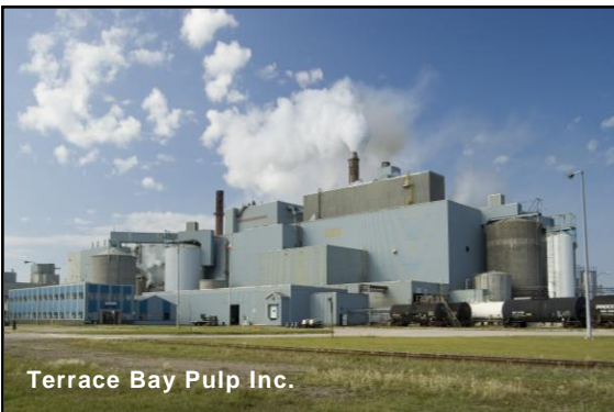
Terrace Bay Pulp Inc.