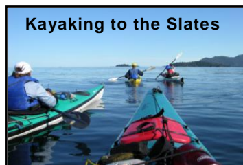
Kayaking to the Slates

Community Development Department Terrace Bay Community Centre, 1 Selkirk Ave, Terrace Bay, ON P0T 2W0 Office: (807) 825-3315, Ext. 230 Fax: (807) 825-9576 Email: info@terracebay.ca Web: www.terracebay.ca