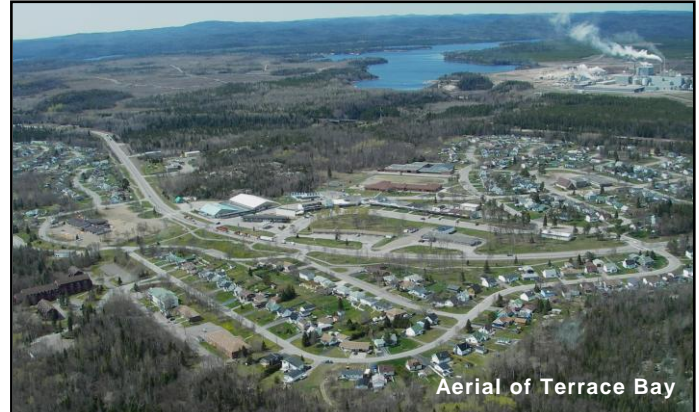
Aerial of Terrace Bay

Terrace Bay is originally named after the sand and gravel terraces which were left behind when ice glaciers receded about 20,000 years ago. The Township of Terrace Bay originated as an undeveloped area catering to the needs of the forestry industry and progressed into a planned community developed by the Kimberly Clark Pulp and Paper Company on July 1, 1959. The town is strategically located with access to the Trans Canada Highway, Lake Superior and established railroad infrastructure. The municipality has a population of 1,800 residents with 5,000 more within a 45 minute drive and approximately 140,000 within a 2 hour drive.