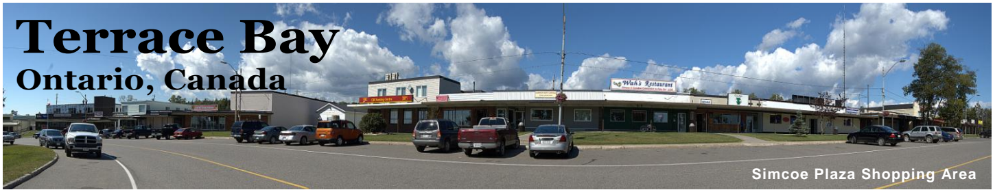
Simcoe Plaza Shopping Area